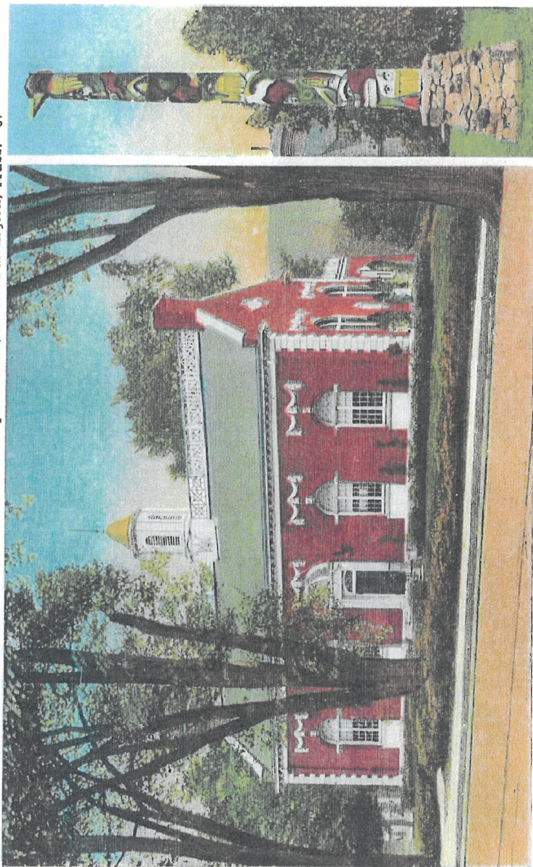
Mason Library and Alaskan Totem Pole in Library Grounds, Great Barrington, Mass.—57