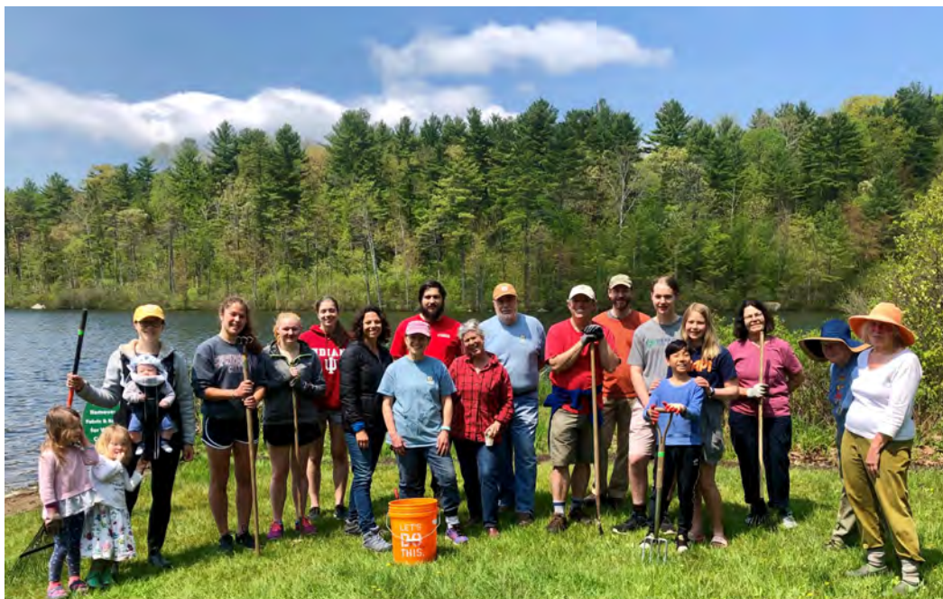
PHOTO: May 19, 2019 Annual Clean Up and Family Fun Day

Folks interested in volunteering must register by emailing info@gbland.org . Be sure to include the dates you are hoping to help out. Volunteers should come with masks, work gloves, and water bottles. Sanitized tools will be provided. Social distancing will be maintained.